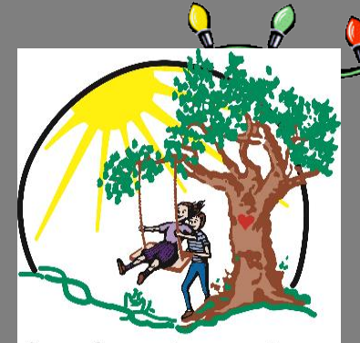
SCOTT COUNTY LICENSED FAMILY CHILD CARE ASSOCIATION - MN